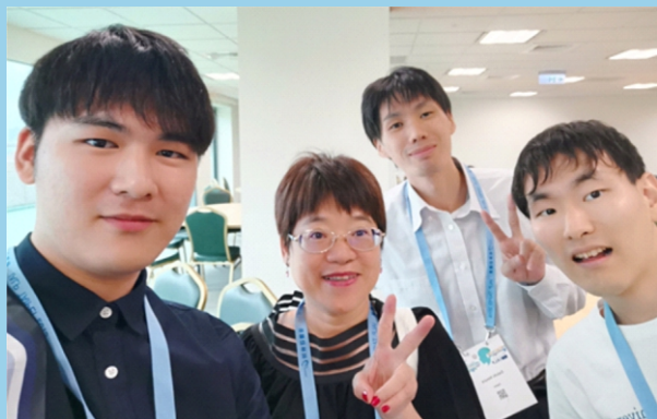
The author and student attendees from Japan and Taiwan whose major are in fluency disorders